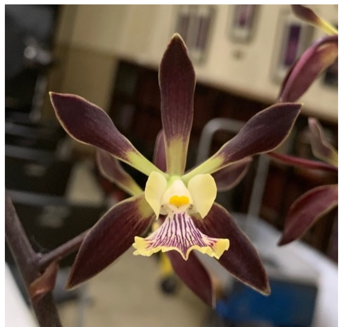
Unregistered Encyclia ( Cynthia x Ginger Snap )