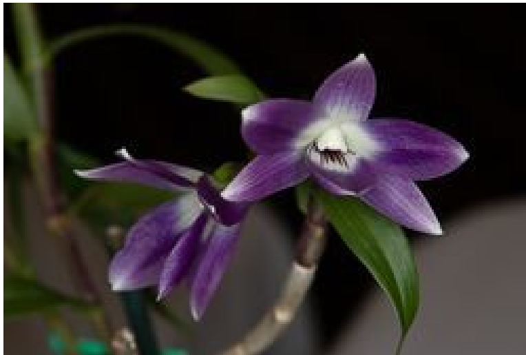
Den. victoria-reginae