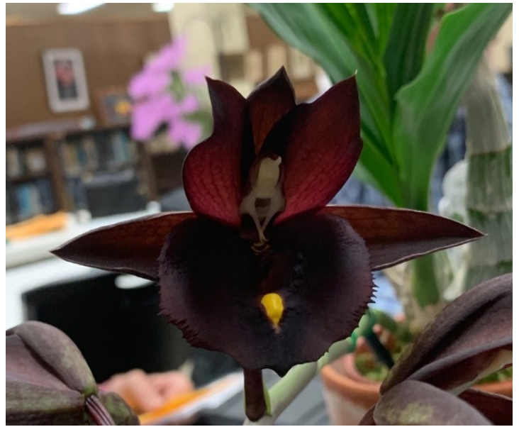
Ctsm. Pileabrosum Green 'SVO' AM/AOS