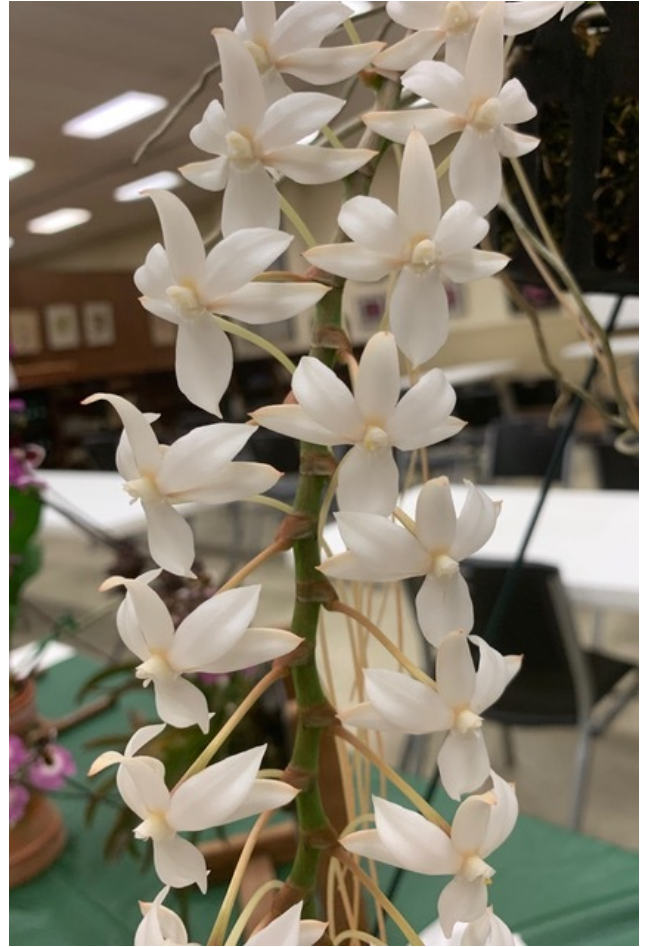
Aerangis Elro 'Daisy Chain' AM/AOS