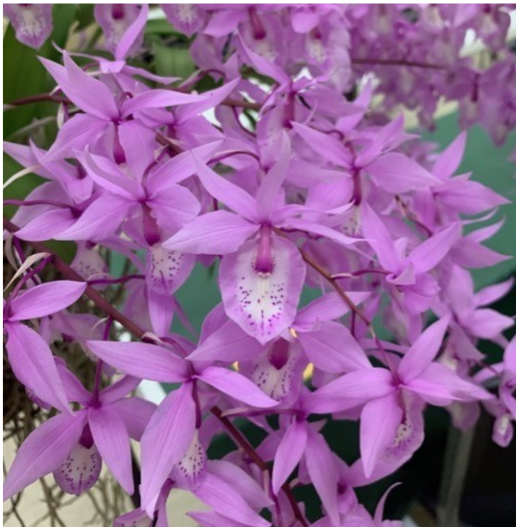
Barkeria spectabilis 'Mona' AM, CCE/AOS