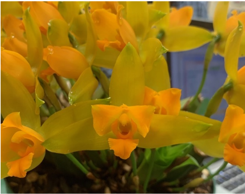
Lyc. aromatica 'Fire Mountain Gold' AM/AOS